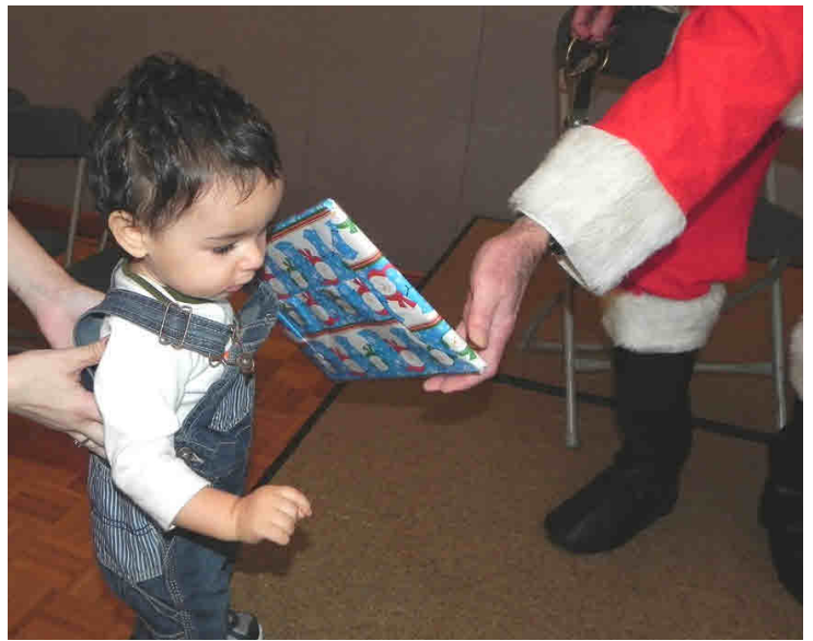
Che carino !!