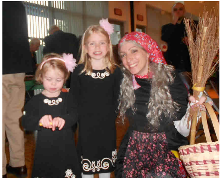
Cheese! Is this a toothpaste ad?