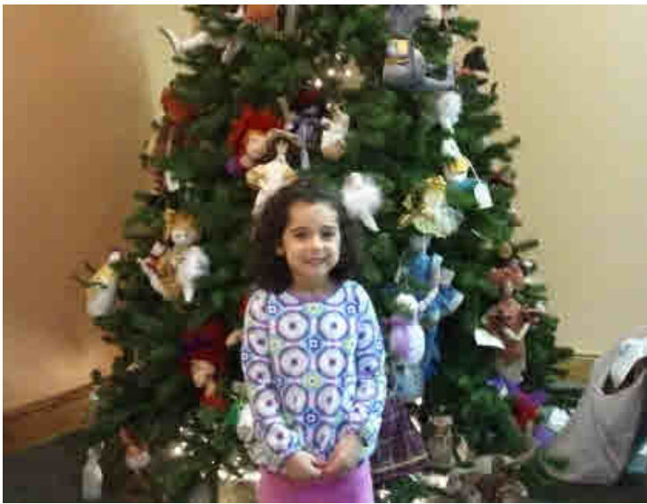
Che bel sorriso!