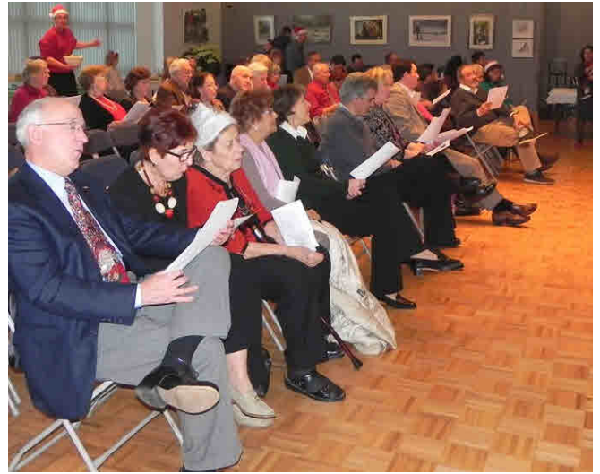
Le Canzoni di Natale