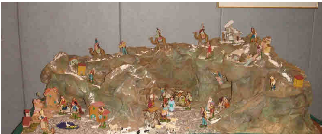
Il Presepio di Monte De Luca