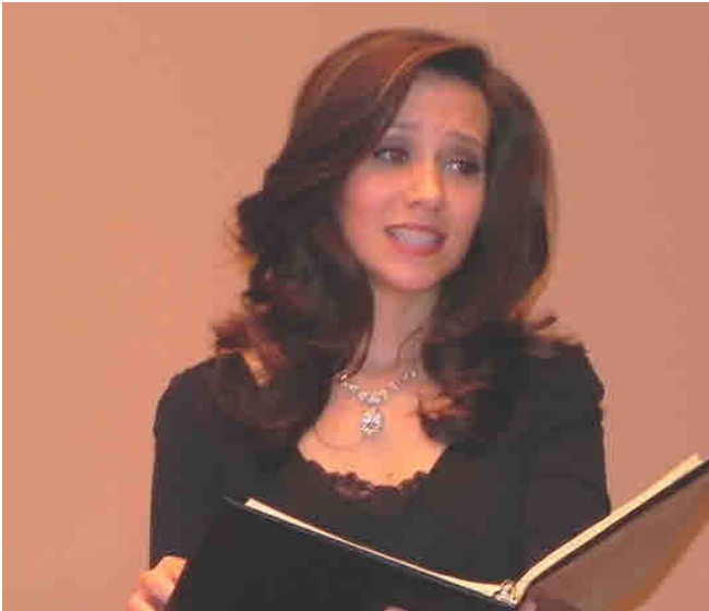
"O mio babbino caro"