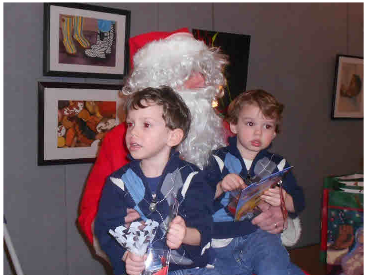
Come on boys, pay attention to Babbo Natale!!