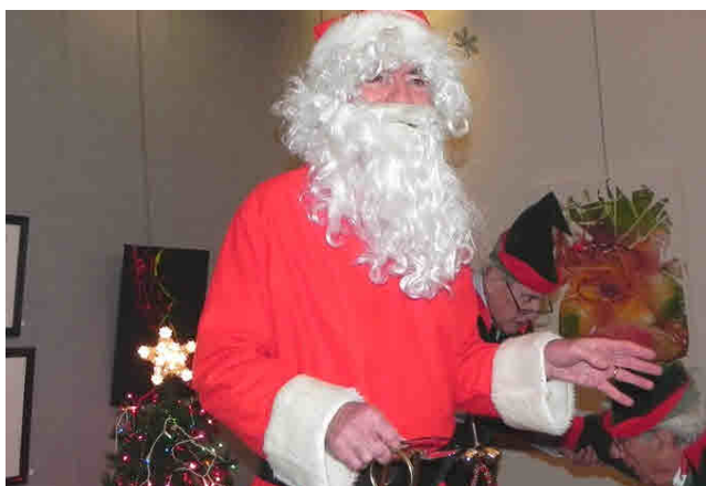
Babbo ise de broder of de Santi Clos