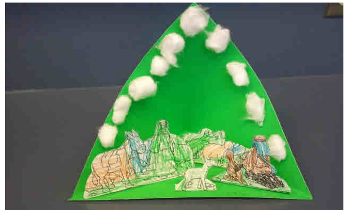
The Product of Santa's Workshop