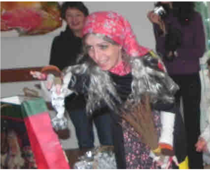
Mi raccomando.....il carbone!