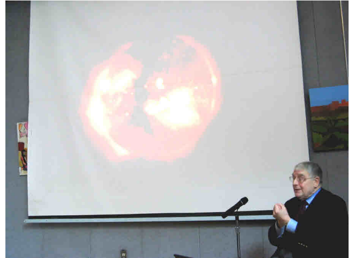
Image of the sun emitting X-rays