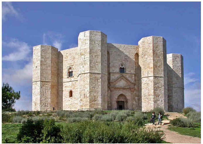
Castel del Monte

Perhaps no other feature of the Castel del Monte fascinates like its octagonal design. The number eight recurs as a numerical theme, most obviously in its octagonal layout and eight octagonal towers, which create an overall crown shape. The significance of the number eight is open to speculation but most likely it held several meanings, with which the multi-faceted and learned king was no doubt familiar.