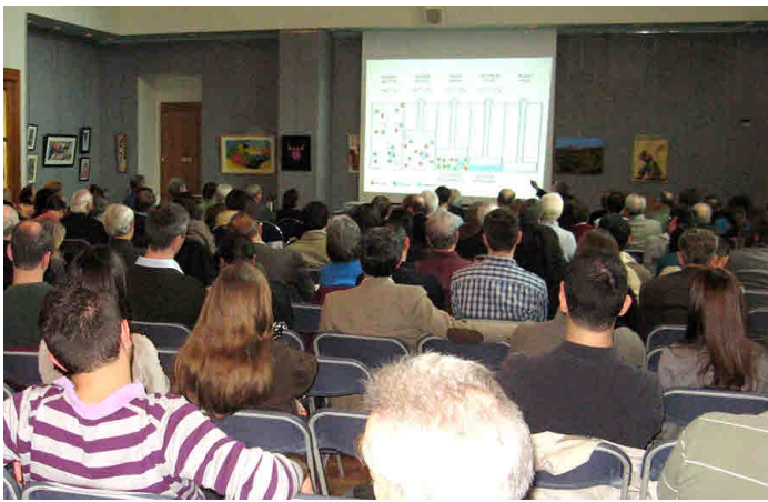
A big crowd