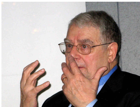
Riccardo Giacconi (more on p. 11)

We have no official count, but probably about 160 persons attended our October social meeting that featured a grand tour of the universe...as we currently understand it...and the point is that now we know that we really don't understand about 97 % of it! This starry message came to us from one of the great astronomer-observers of our time, Nobel laureate x-ray astronomer Riccardo Giacconi, in a masterful illustrated lecture that began with Copernican circles, featured an actual movie of the pulsating Crab Nebula, and ended with a universe running away under the inexorable push of dark energy! This unsettling vision made it necessary to return our cosmos-struck audience to more earthly comforts, and for this purpose, naturally, major equipment of Italian design had to be deployed ... wonderful freshly-baked sfogliatelle , and cantucci , and frollini all'albicocca , served with a champagne peach-nectar punch.