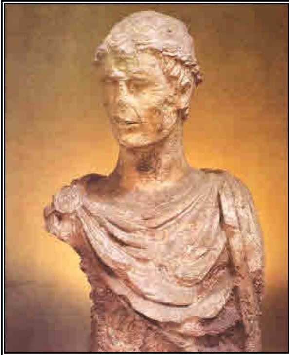
Federico II as Augustus

The Castel del Monte, the most artistically and scientifically advanced building of its time, is one of Europe's most famous castles, and yet its true function remains a puzzle to this day. Not built as a fortification, but as an intellectual exercise, it stands as a monument to the towering influence of its master planner, King Frederick II, a man whose