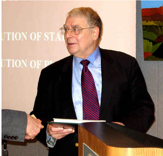
A token of our appreciation