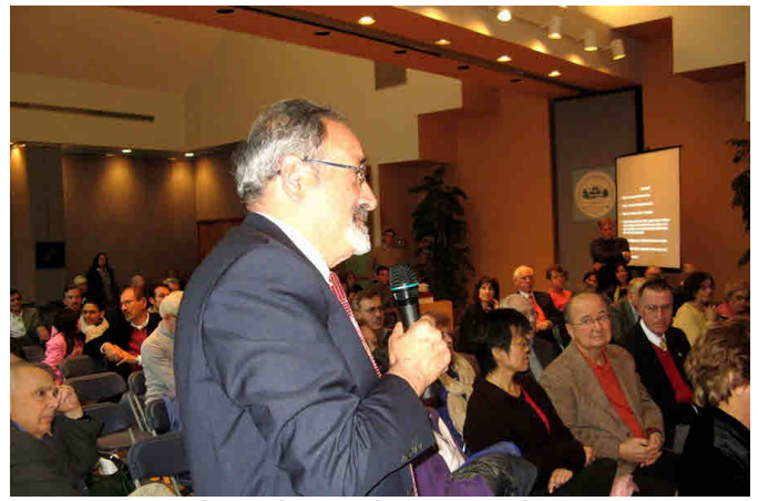
A student asks a question